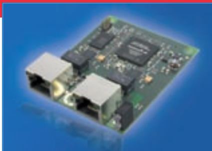
The Industrial Ethernet Module (IEM) supports a fast and cost-efficient realization of a SERCOS III interface