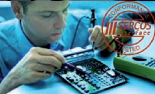
SERCOS inside: New SERCOS III Conformance Test available

Shrinkpacker Smiflexi SK 600T: Simple architecture for fast format changeover