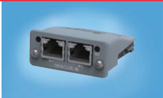
Application: The easy way to SERCOS