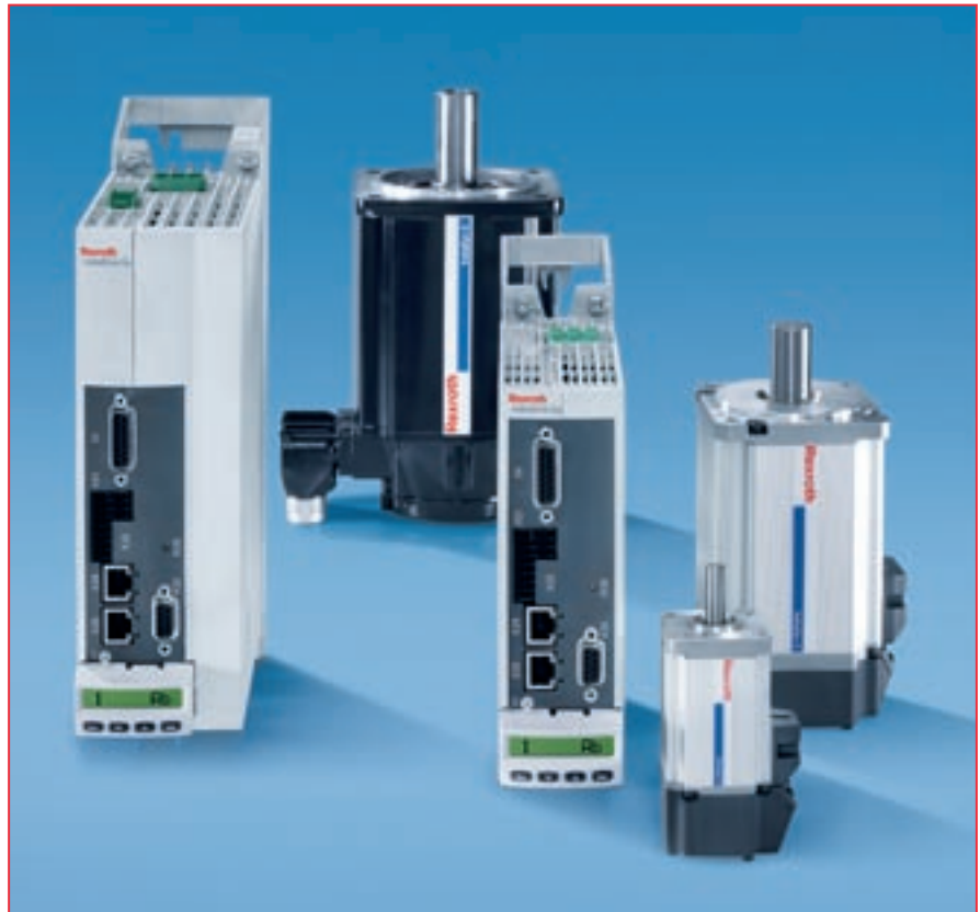
The electronic camshaft of the machine with 16 compact Rexroth IndraDrive Cs servo drives reduces the changeover almost completely to software commands.

explains Pietro Volpi – the automation components of both versions communicate via SERCOS III with the controller.