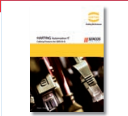
SERCOS III Cabling for industrial and automation applications