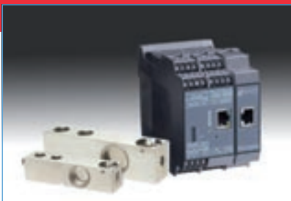
High-precision and high-speed weighing with SERCOS III