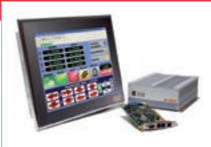
OPEN20 – Numerical Control with SERCOS III interface