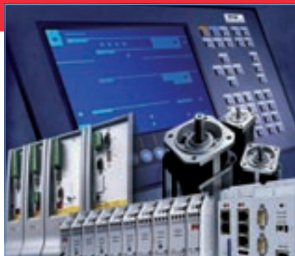
SERCOS III product range for the ExC66 controller family