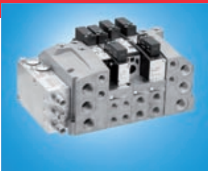
The pneumatic valve terminal system: modular and sturdy design