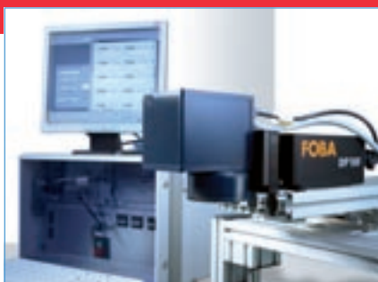
MOTF (Marking on the fly) with FOBA Laser systems and SERCOS III