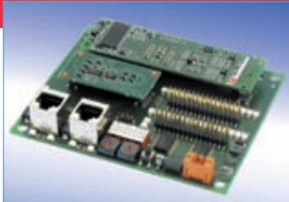
Modular evaluation kit for Real-time Ethernet