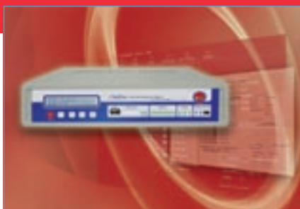
Powerful and flexible design platform for automation applications