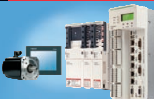
Product-News: PacDrive 3 – Ethernet-based Automation Technology