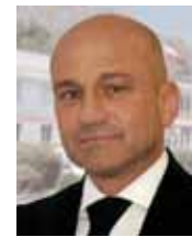
Paolo Nava, CEO, SMI Group.

Mississauga, Ont.-based industrial equipment distributor Omnifission Inc. has been appointed as the exclusive sales agent for the central and eastern regions of Canada—including stocking of spare parts and offering comprehensive after-sales support—for the complete “world-class” cold-fill filling lines, palletizing/depalletizing, conveying, shrinkwrapping, multipacking, case-packing and tray-packing equipment manufactured by the Italian-based SMI Group .